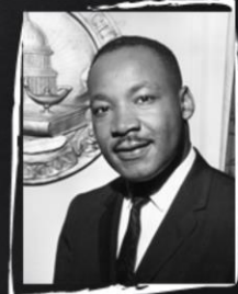
Dr. Martin Luther King Jr.