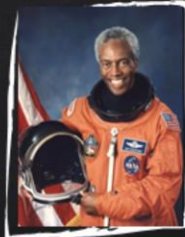
Guion "Guy" Bluford